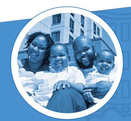
GARDENER FAMILY EARLY HEAD START

I think Community Works is a good place for parents who are low income or without a big support system. They really want to help you move up and transition in society. It's multipurpose so you can get everything you need in one place - that's pretty unique.