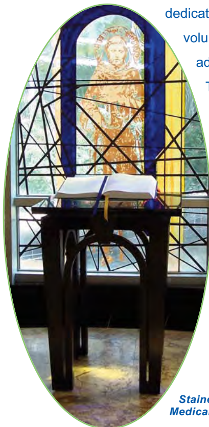
Stained glass rendering in chapel of Bon Secours St. Francis Medical Center depicting St. Francis of Assisi

I would also like to take this opportunity to personally thank each and every one of you for your dedication and commitment to Bon Secours St. Francis Medical Center. From the earliest volunteers, physicians, staff, board members, and donors to the newest, most recent additions, thank you for sharing your gifts and talents in the service of Good Help to Those in Need™. You are the reason this facility is successful and known by patients as one of the leading hospitals from which to receive care in the Richmond region. It is because of your efforts, large and small, day in and day out, that we are a premier healing ministry. I look forward to another amazing five years of service to our community.