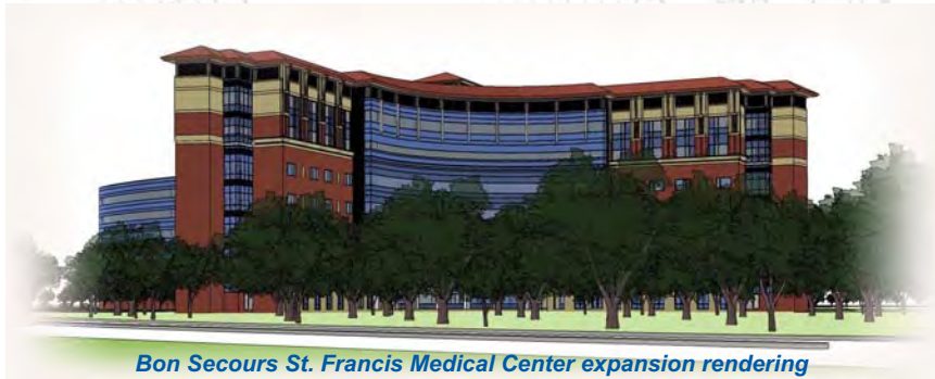
Bon Secours St. Francis Medical Center expansion rendering

Our mission is constant: to bring compassion to healthcare. Our commitment is firm: to help bring people and communities to health and wholeness. Our promise is eternal: good help to those in need.