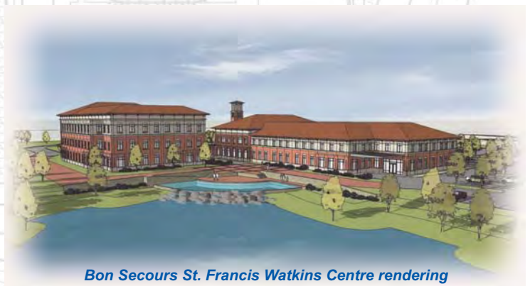
Bon Secours St. Francis Watkins Centre rendering